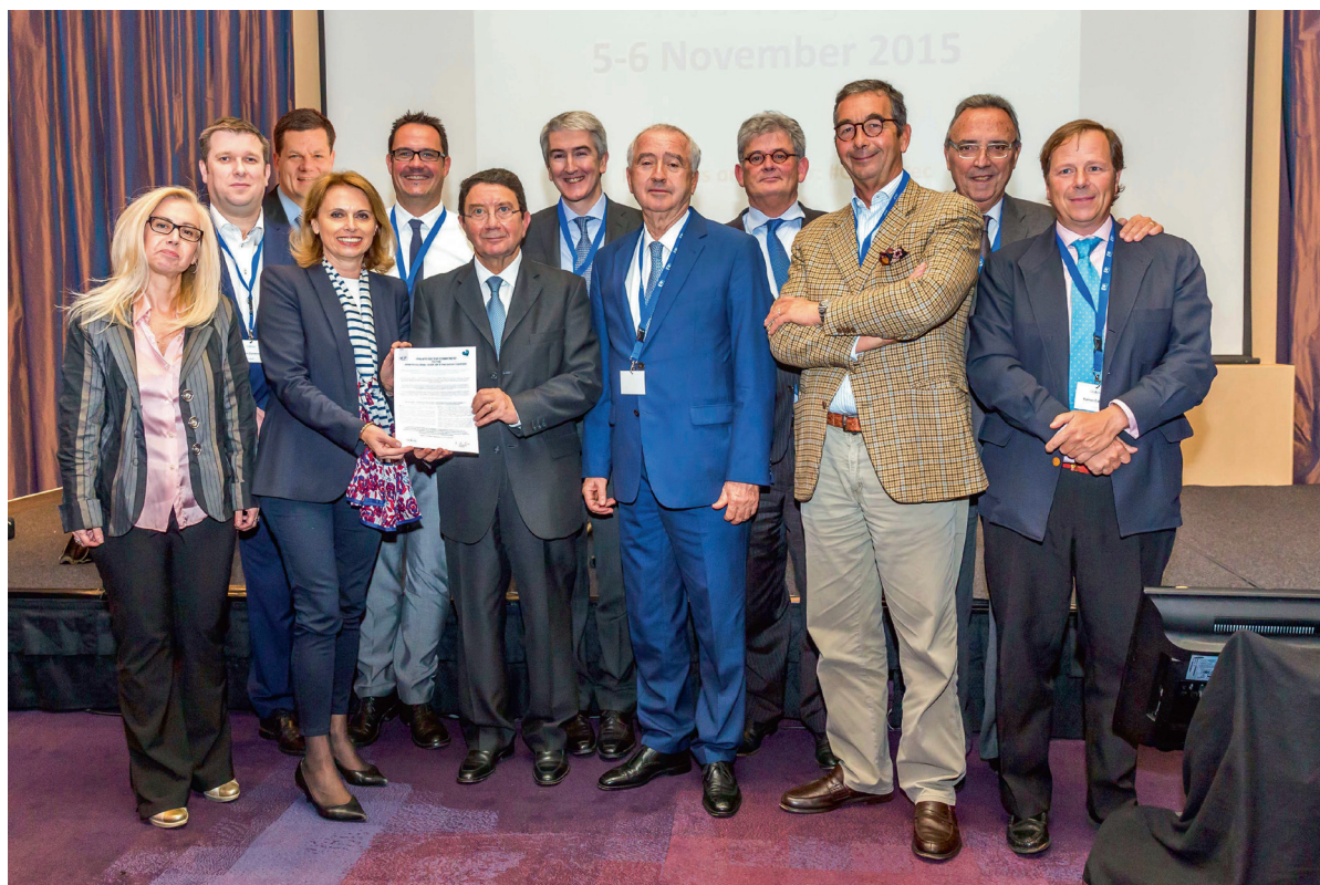
HOTREC Executive Committee and CEO with UNWTO Secretary General Taleb Rifai during HOTREC General Assembly in The Hague on 5 November 2015